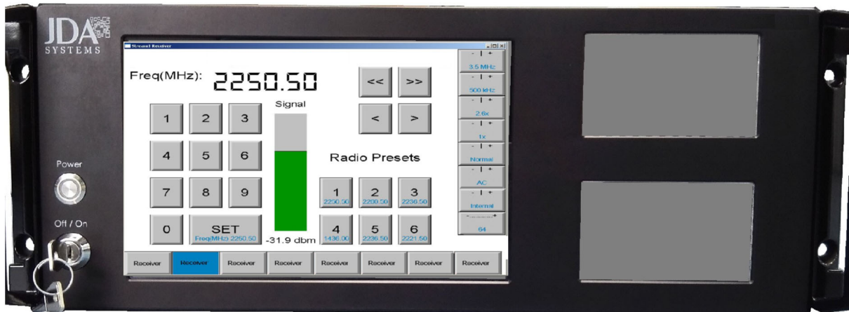
SNRP-8-12-LSC Base System

The SNRP-8-12-LSC represents a new way of recovering telemetry signals from multiple test objects on a test range. The unit can take up to 8 antenna inputs and provide the best signals from these to any mix of 12 receiver compatible outputs, all in a single 19 inch rack mountable chassis.